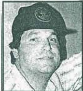
Kipling Developments "ROMAN"

16 Years Experience Master Civil Engineering